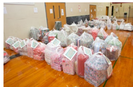
Gifts all ready to deliver to local families, with the holiday’s best wishes from volunteers at Sanofi.

Head Start is a free, federally funded program that provides comprehensive early childhood education, health, nutrition and family support services to promote school readiness for children from low-income families. It also offers services for pregnant women through its Early Head Start component. These programs focus on cognitive, social, and emotional development, actively involving parents as partners in their child’s learning journey to build strong foundations for kindergarten and beyond.