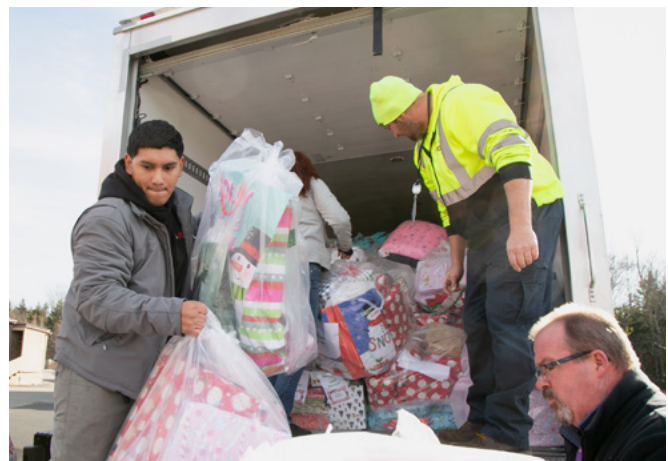
Sanofi “Adopt-a-Family” volunteers unload bag after bag of colorfully wrapped gifts for Head Start families.