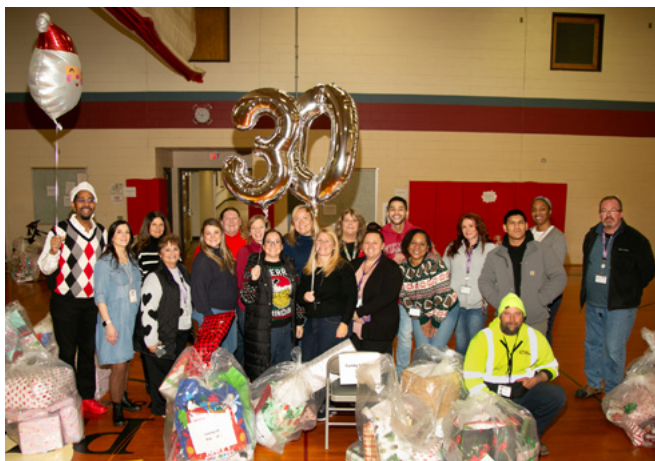
Some of Sanofi’s “Secret Santas,” celebrating 30 years of giving back to neighbors in need.