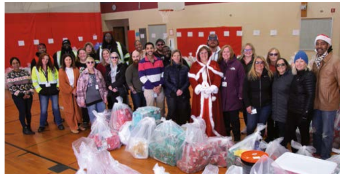
Santa's helpers from Sanofi