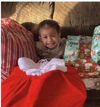
Some of the happy faces made possible by Sanofi employees' Adopt-a-Family drive

In this issue, you'll see how Sanofi people, inside and outside the workforce, live out the Golden Rule: "Do for others as you would have them do for you."